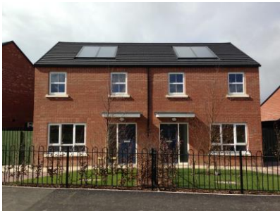
Apex Housing Association

We are working to get more new houses that are easy for disabled people to live in.