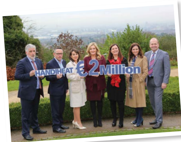
Representatives from partner organisations across Northern Europe launched the project at Belfast Castle earlier this year.

"Handi-Heat is a fantastic opportunity for us to collaborate with a range of organisations from the Republic of Ireland, Finland, Iceland and the Shetland Islands to find solutions to problems faced by rural householders such as a reliance on home heating oil."