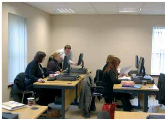
SPOCC.net Pathfinder Training with FHOSS

access and performance of SPOCC.net. This will help inform the general rollout.