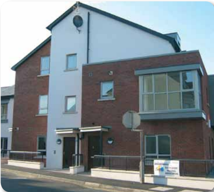
Locke House, Portadown

In November 2009 the first tenants started their planned move into their new accommodation at Locke House, Thomas Street, Portadown.