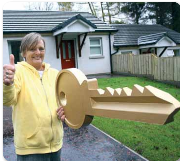
Getting the key to the house at Millburn Close, Castlereagh

Millburn Close is a new, purpose built supported housing development for people with mental health problems. Located in the Knockbracken area of Castlereagh, the scheme is jointly funded by SP and the Belfast Health and Social Care Trust and was developed in a partnership with the Northern Ireland Association for Mental Health (NIAMH) the support service provider and Habinteg Housing Association.